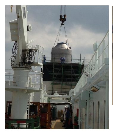
Placement of New Scrubber